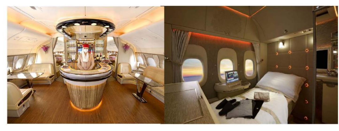
Fly in style with Emirates Airbus A380 First Class in a close suite.

Experience the ultimate luxury and comfort during your Umrah pilgrimage with Emirates Airbus A380. Our premium flight services are dedicated to providing you with the highest level of comfort, style, and sophistication during your spiritual journey. Relax in your spacious private suite, indulge in gourmet dining, and enjoy a wide range of entertainment options all while soaring in the skies. Emirates Airbus A380 First Class offers a truly exceptional flying experience that you'll never forget. Book now and elevate your Umrah pilgrimage to new heights.